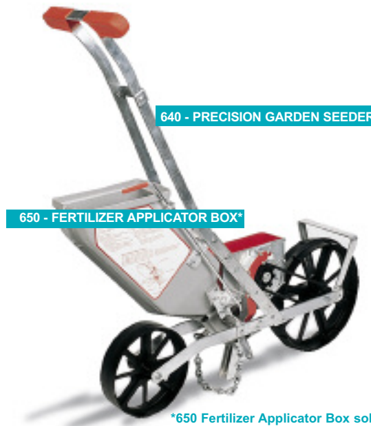
640 - PRECISION GARDEN SEEDER