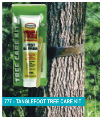
777 - TANGLEFOOT TREE CARE KIT