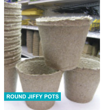
ROUND JIFFY POTS