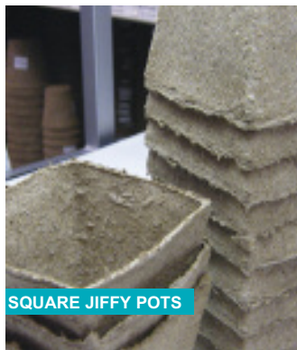
SQUARE JIFFY POTS