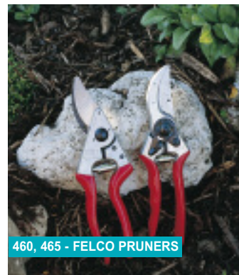
460, 465 - FELCO PRUNERS