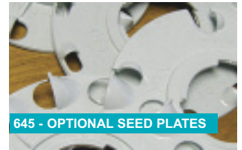
645 - OPTIONAL SEED PLATES