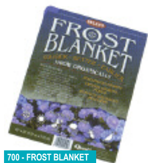
700 - FROST BLANKET