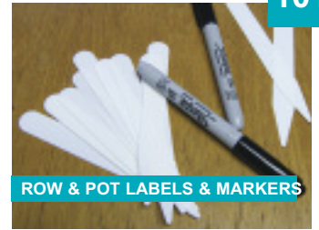
ROW &amp; POT LABELS &amp; MARKERS