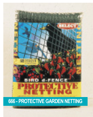
666 - PROTECTIVE GARDEN NETTING