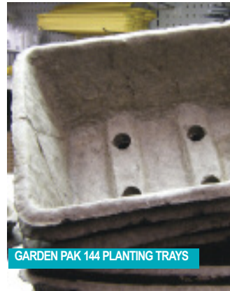
GARDEN PAK 144 PLANTING TRAYS