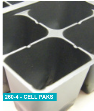
260-4 - CELL PAKS