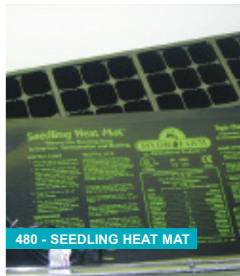
480 - SEEDLING HEAT MAT