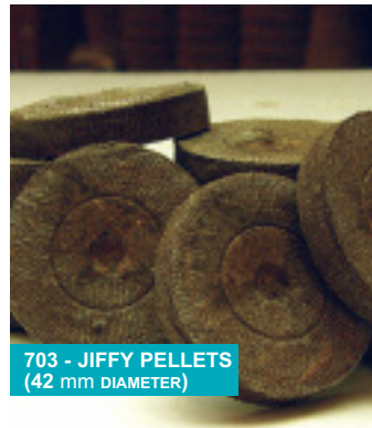
703 - JIFFY PELLETS (42 mm DIAMETER)

Small wafers of compressed peat encased in a plastic net. When water is applied, it expands to form a pellet 4.3cm (1.75") in diameter and about 5.3cm (2.125") deep. Seeds or transplants may be directly sown into the pre-drilled hole in centre of pellet.