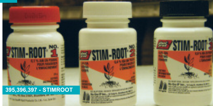
395,396,397 - STIMROOT