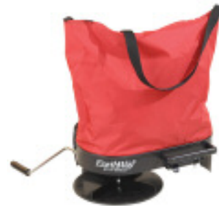
647 - OVER-SHOULDER SEED SPREADER