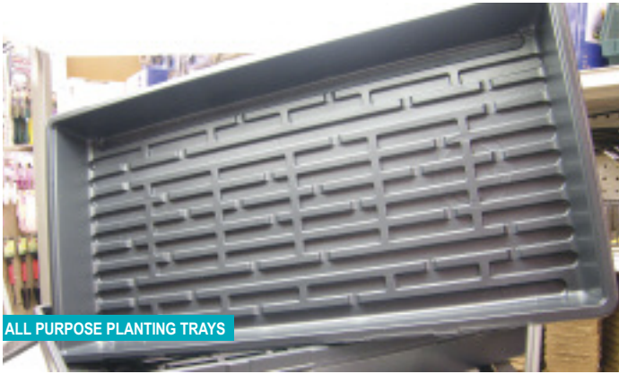
ALL PURPOSE PLANTING TRAYS