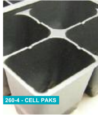
260-4 - CELL PAKS