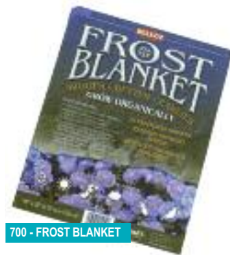
700 - FROST BLANKET