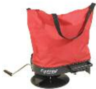
647 - OVER-SHOULDER SEED SPREADER

#650 – OPTIONAL FERTILIZER ATTACHMENT $89.99