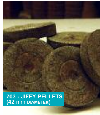
703 - JIFFY PELLETS (42 mm DIAMETER)

Small wafers of compressed peat encased in a plastic net. When water is applied, it expands to form a pellet 4.3cm (1.75") in diameter and about 5.3cm (2.125") deep. Seeds or transplants may be directly sown into the pre-drilled hole in centre of pellet.