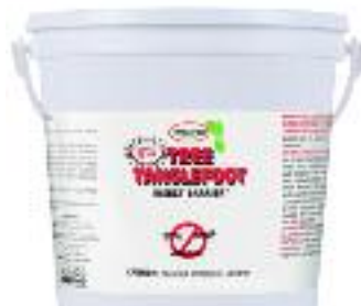
779 - TANGLEFOOT INSECT BARRIER