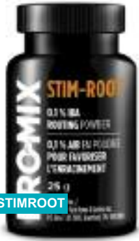
395 - STIMROOT