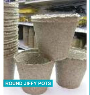
ROUND JIFFY POTS