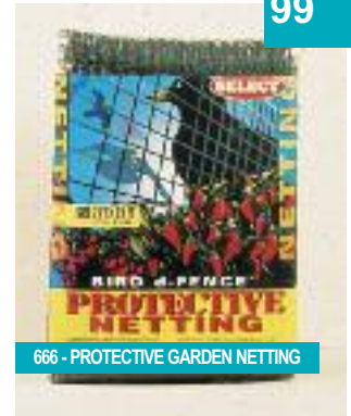
666 - PROTECTIVE GARDEN NETTING