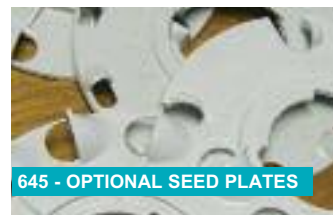
645 - OPTIONAL SEED PLATES