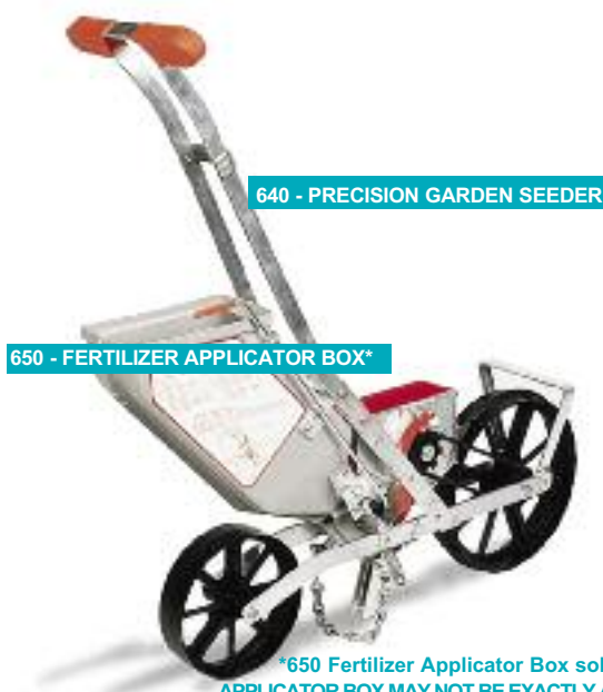
640 - PRECISION GARDEN SEEDER