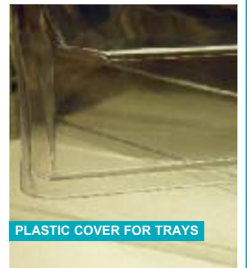
PLASTIC COVER FOR TRAYS