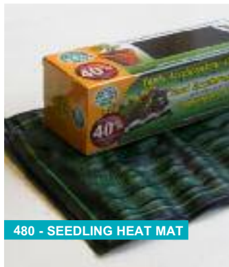
480 - SEEDLING HEAT MAT