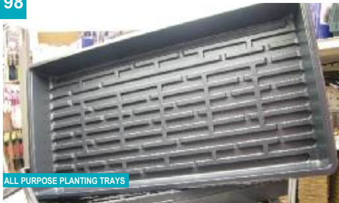
ALL PURPOSE PLANTING TRAYS