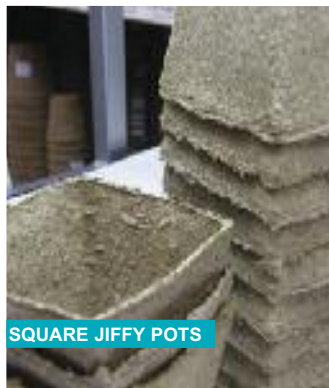
SQUARE JIFFY POTS