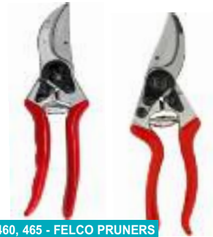
460, 465 - FELCO PRUNERS