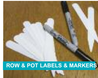
ROW &amp; POT LABELS &amp; MARKERS