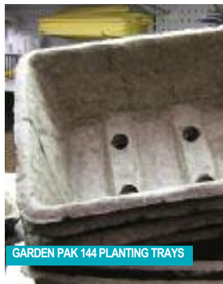
GARDEN PAK 144 PLANTING TRAYS