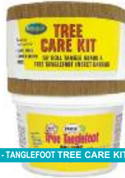
777 - TANGLEFOOT TREE CARE KIT